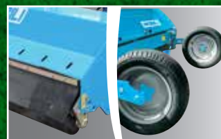
Roller and wheel options for accurate height control