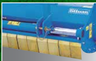
Hydraulic and manual side-shift options