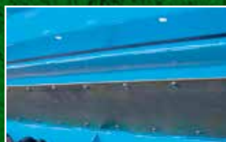
Double skin or wear plate options for increased working life