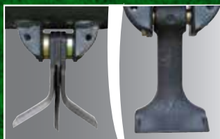
Knife and hammer blade options to suit the application

Hydraulic side shift is suited to applications where there are varying row widths or mulching under tree canopies is necessary.