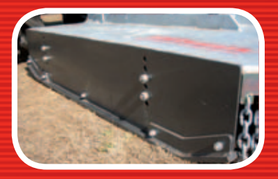
Rated lifting chains on the Shireboss attach to a gusseted head stock

All slasher skids are height adjustable with separate holes to avoid slippage. Shireboss skids include replaceable runners