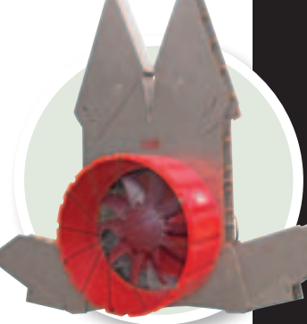
TALL TOP RADAK - WIDE BOTTOM WINGS

Row width: Up to 10 metres Tree height: Up to 10 metres